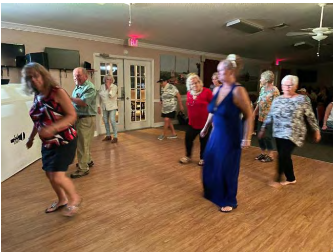
Line Dancing done easy