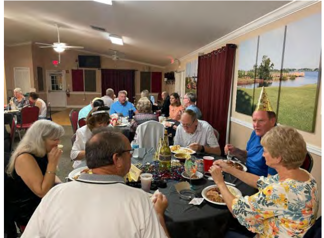
Macarena Dancing Flamingo