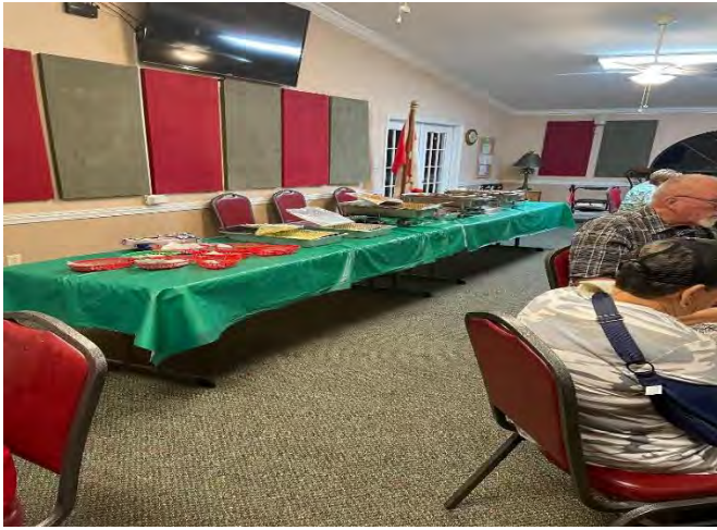
Food Catered by Sony's BBQ