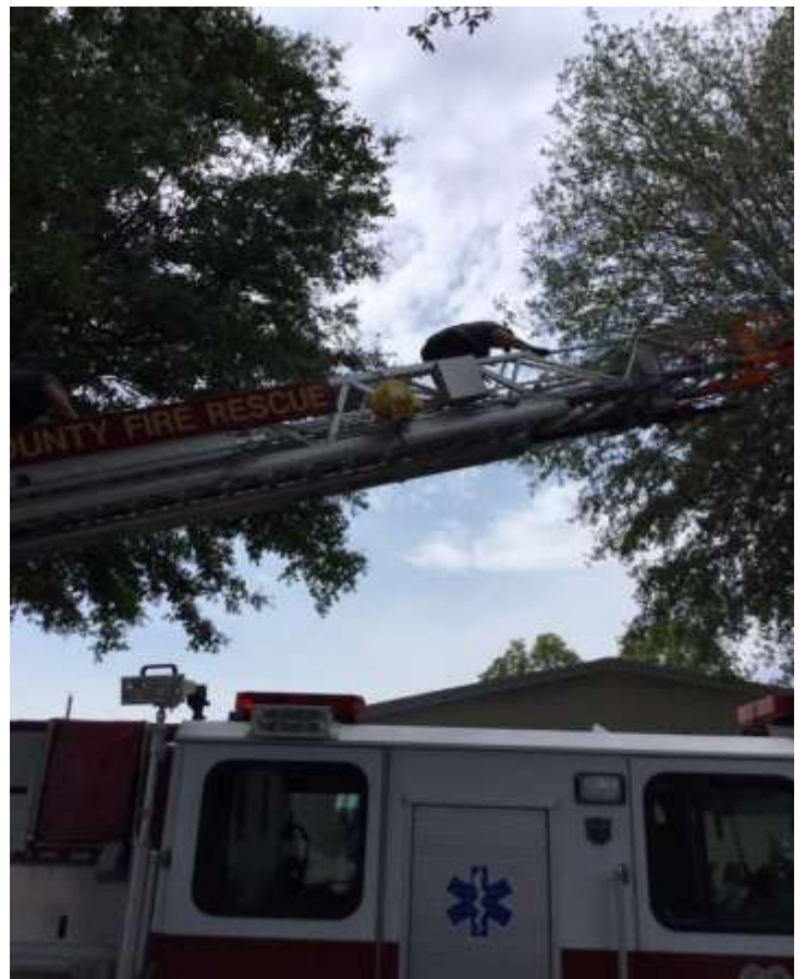
PASCO COUNTY HEROES TO THE RESCUE 4/15/2021

Thank you Pasco County Rescue, Ladder 32 C Shift. Rescued neighbors cat from tree on Mesquite!