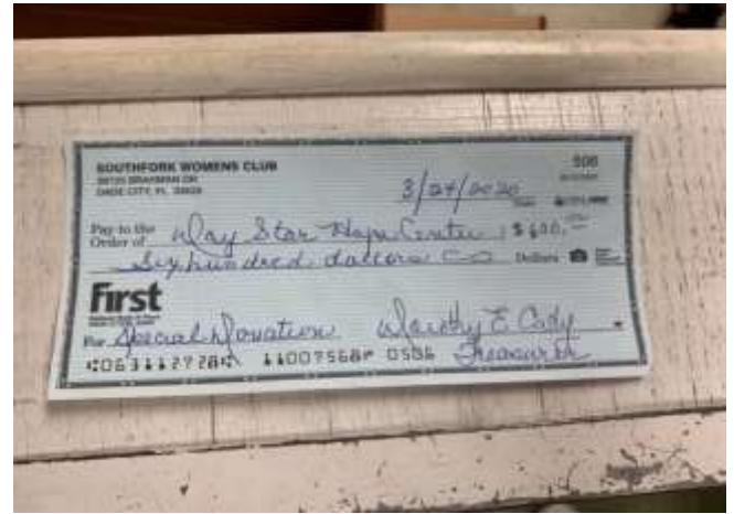
Donations made from the Women's Club to Day Star.

Check from the dinner/donations from our scheduled Soup/Chili dinner of ticket money given by the residents which totaled $600.00 along with the Easter Basket donations. They were presented to Day Star and accepted with such gratitude and they could not thank the Women's Club enough in these troubled times and how much this was needed.