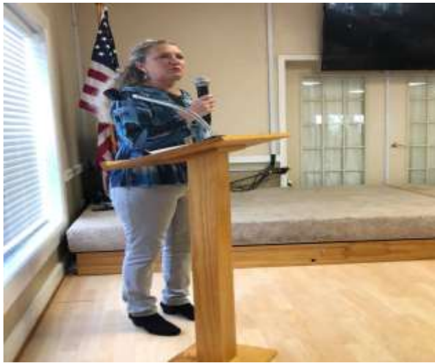
Speaker from Bon Worths