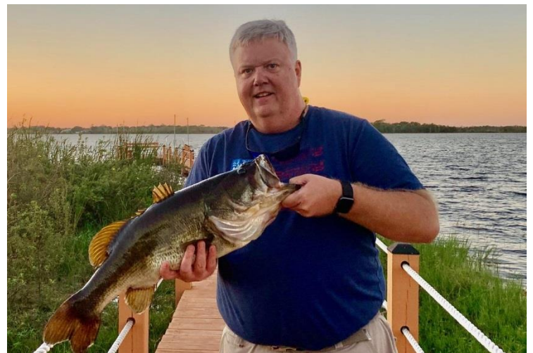
SOME OF THE RESIDENTS SHOWING OFF THEIR CATCHES IN OUR LAKE AT LAKE HAMMOCK VILLAGE