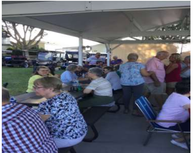
Street Dance 10/12/2019