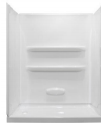
TUBS & SHOWERS