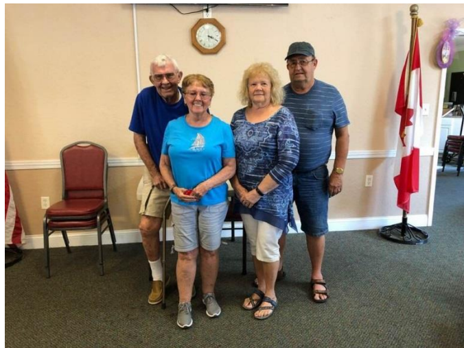
Third Place – The Bowdens and Greenfields