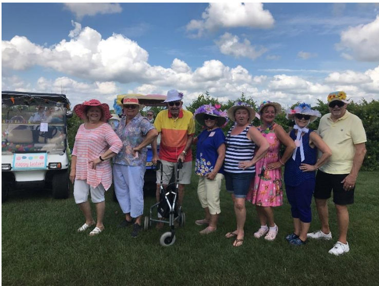
FRONT Lake Hammock Easter Bonnet Contestants