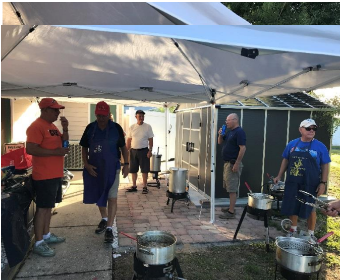
LHV ANNUAL SPRING FLING PIG ROAST AND AIRBOAT RIDE